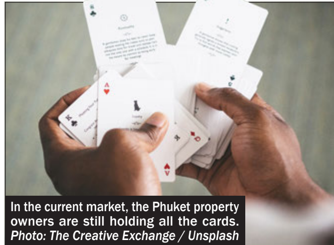
In the current market, the Phuket property owners are still holding all the cards.

We accept that it is impossible to reach everyone, but we hope people will have read these articles with an open mind and recognise that a lot of thought has gone into dissecting the arguments for and against a "Covid Crash" in Phuket property. We have never claimed that 2020 is going to be a banner year for real estate on the island, but