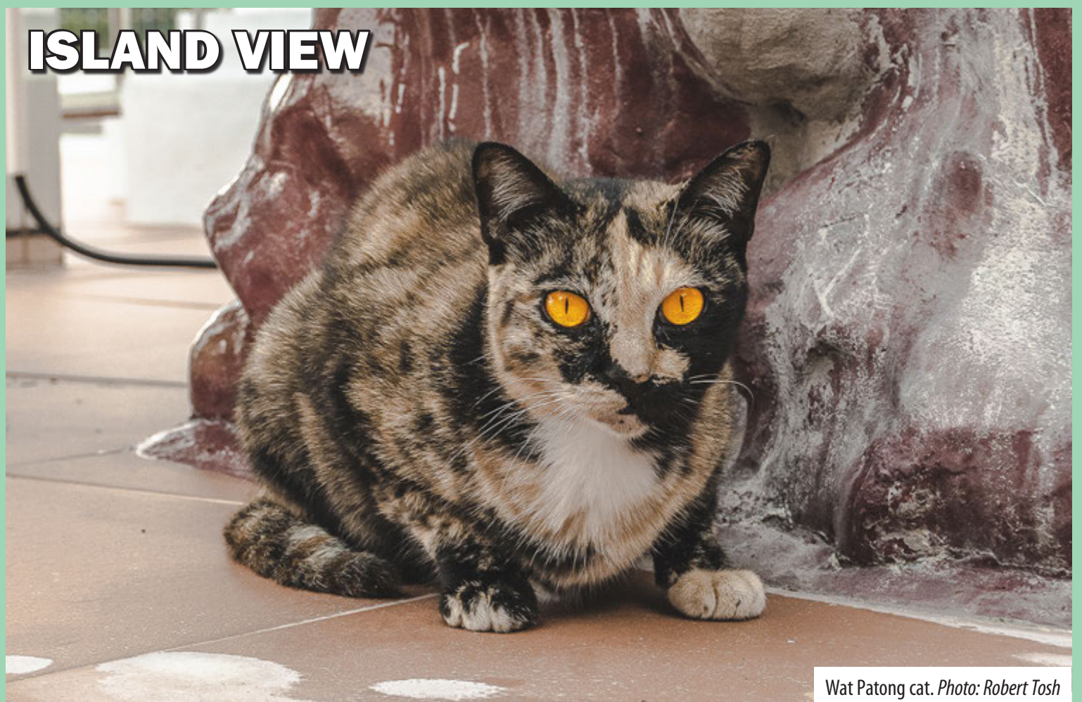
Wat Patong cat.

Got an unusual or particularly beautiful picture of Phuket? Email it to exceditor@classactmedia.co.th