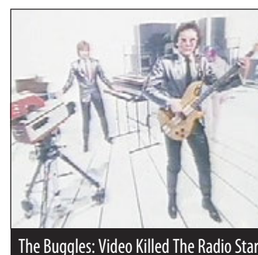
The Buggles: Video Killed The Radio Star

The Japanese Red Army takes more than 50 hostages at the AIA Building housing several embassies in Kuala Lumpur, Malaysia. The hostages include the US consul and the Swedish Chargé d'affaires.