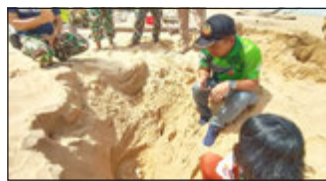
The nest was found two kilometres from where another nest was discovered on July 7.

and found the nest some 90 centimeters deep in the sand.