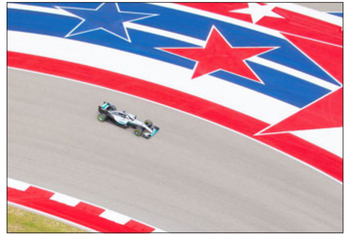
The US Grand Prix has been scrapped.

"Always good for the profile," he said smiling. "We like to show off sometimes, everyone does."