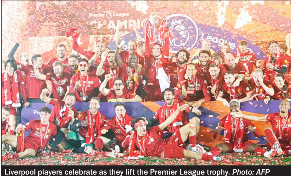
Liverpool players celebrate as they lift the Premier League trophy.

Manchester United and Leicester City went into their game knowing that, with the correct result, either team could finish the day in a top four position and therefore qualify for next season's Champions League.