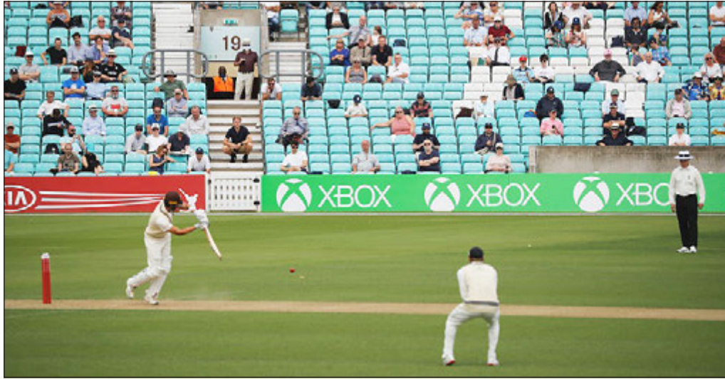
Surrey welcomes the first members of the public to a live sporting event in England since the coronavirus pandemic swept through the country in mid-March.

Stoneman and Patel had 1,000 members – mostly from Surrey but some from rivals Middlesex – to cheer them on a day that even the