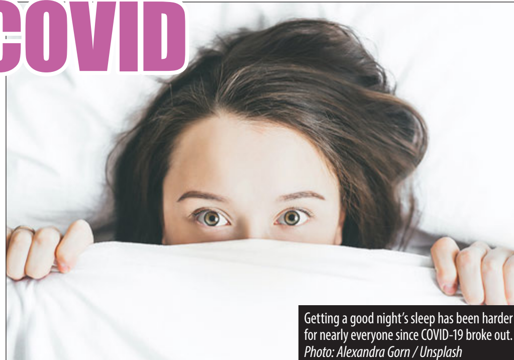
Getting a good night's sleep has been harder for nearly everyone since COVID-19 broke out.

There are many reasons why sleep affects fat loss – most to do with creating hormonal imbalances. For example, sleep deprivation leads to cortisol (stress hormone) issues and there is a clear link between stress and fat storage. The thyroid, our master gland of metabolism is also affected and doesn't help burn that fuel as well as we need it to be done. Then sleep affects all the sex hor-