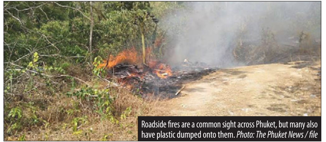
Roadside fires are a common sight across Phuket, but many also have plastic dumped onto them.

Plant Trees and hedges to replace parking spaces in the city centres of Phuket with