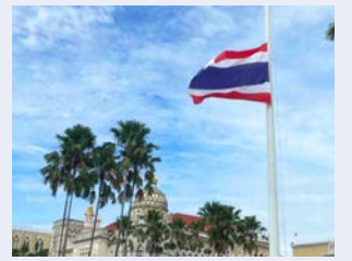
The Thai national flag flies at half-mast at Government House on Friday (Sept 9).

"Meeting Her Majesty, was always a truly enrich-