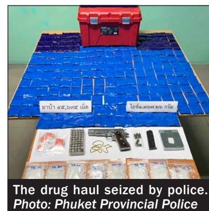
The drug haul seized by police.

The pair were taken to Phuket City Police Station and charged with illegal possession of a Category 1