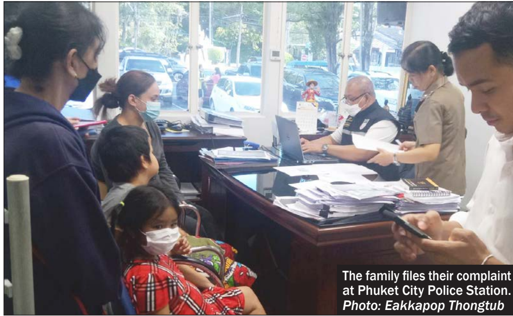
The family files their complaint at Phuket City Police Station.