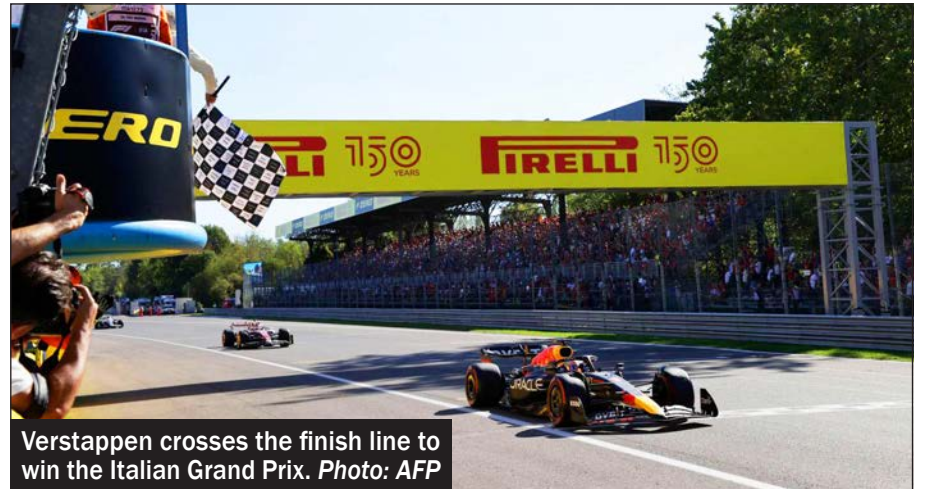
Verstappen crosses the finish line to win the Italian Grand Prix.

It gave Leclerc a 20-second deficit to close in 20 laps, but even on a fresh set