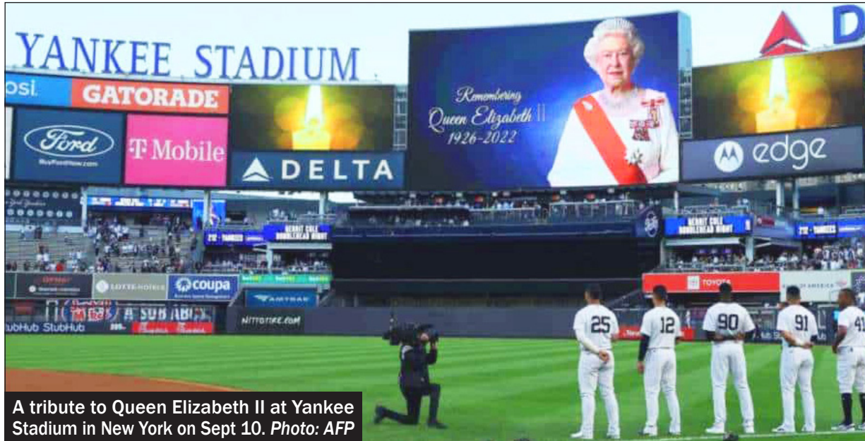
A tribute to Queen Elizabeth II at Yankee Stadium in New York on Sept 10.

Hamilton said: "She was a symbol of hope for so many and she served her country with dignity, dedication and kindness."