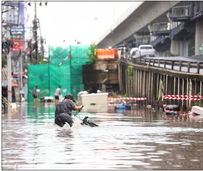
A cyclist stumbles on a flooded street in the Bang Khen district of Bangkok on Sept 8.

Meanwhile, state agencies have to use their remaining budget by Sept 30, which marks the end of the current fiscal year.