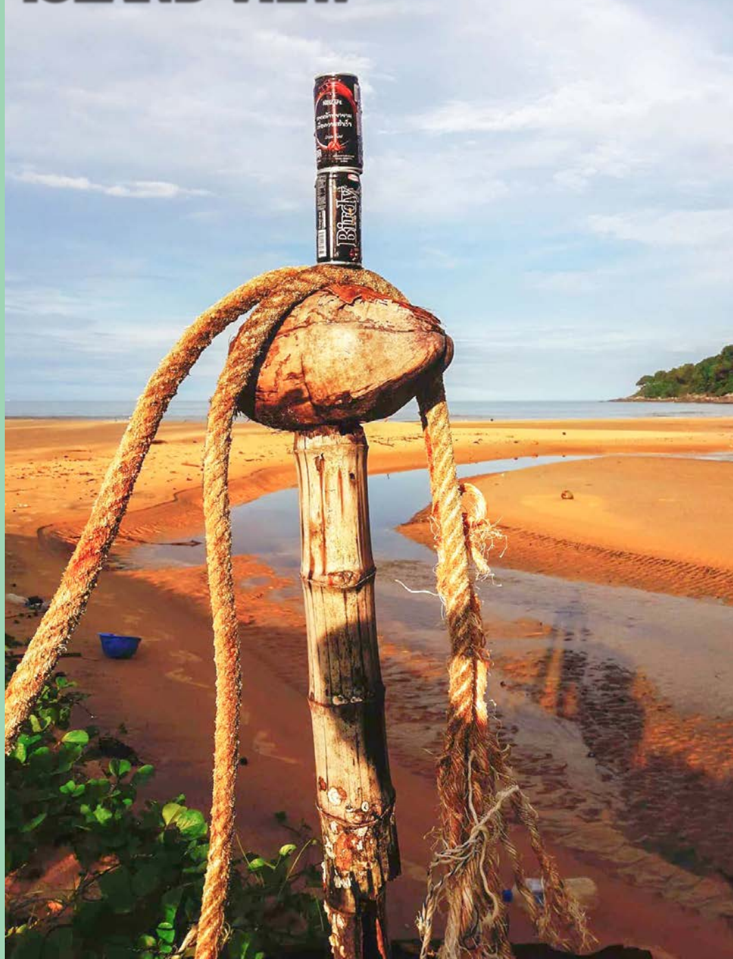
Karon Beach.

Got an unusual or particularly beautiful picture of Phuket? Email it to execeditor@classactmedia.co.th