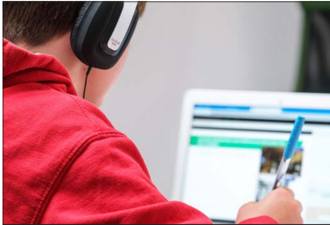
Online learning is opening new frontiers for students and teachers alike, but how we use it effectively is ultimately up to us.

Sloth and gluttony are fairly obvious and literal. Laziness and complacency are reflected in the lack of effort that the students invest, while gluttony is shown in increased obesity rates. As students are left unmonitored, they are also left to make their own injudicious nutritional decisions – resorting to their