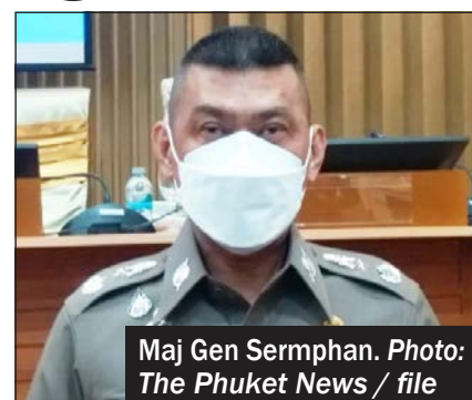
Maj Gen Sermphan.

Phuket Provincial Police’s drug-testing laboratory, where the three suspects underwent urine tests for drugs.