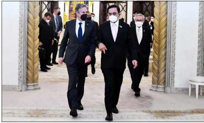
US Secretary of State Antony Blinken (left) meets with Prime Minister Prayut Chan-o-cha at Government House last Sunday (July 10).

Blinken told the prime minister that the joint communique reaffirms the Thai-US alliance and he believes it will lay the foundations of relations