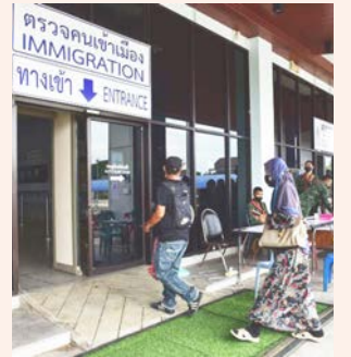
Malaysian tourists at Thai customs in Sungai Kolok.

Only a small number of imported infections have been detected among tens