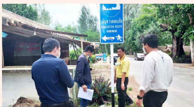
Officials inspect the tsunami evacuation route in Kamala.

occurring southeast of the Andaman and Nicobar Islands has slowed over the past week, according to the non-government Phuket Earthquake Monitoring and Surveillance Center, which also goes by the name 'PhuketSOS'.