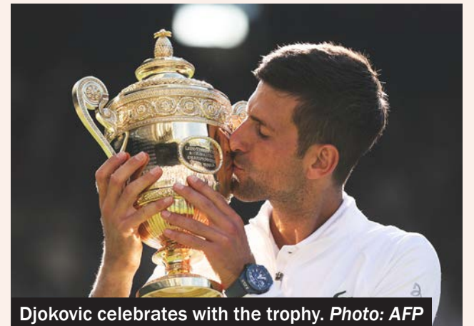
Djokovic celebrates with the trophy.

His refusal to get vaccinated will bar him from