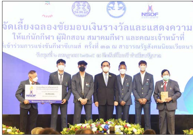
The Athletics Association of Thailand receive their prize money award of B18,900,000.

With 11 nations competing at the 31 st edition of the event held between May 12-23, which had been delayed a year due to COVID-19, Thailand finished in second place overall in the medal table where a total of