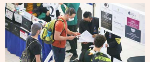
Foreign passengers await instructions from hotel workers inside the arrival hall at Suvarnabhumi airport.