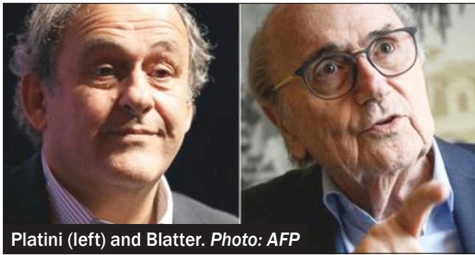
Platini (left) and Blatter.