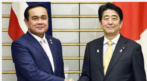
Prayut Chan-o-cha and Shinzo Abe in 2015.

Security protocols were beefed up to ensure safety during Sunday's meeting