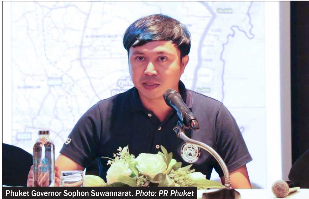
Phuket Governor Sophon Suwannarat.

The Pa Khlok road expansion was part of the Phuket Highways Office highway development plan “to hasten to solve the problem of traffic congestion and expand traffic channels to develop the infra-