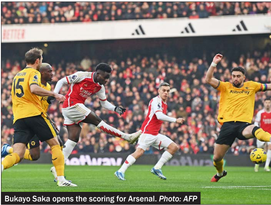
Bukayo Saka opens the scoring for Arsenal.

High-flying Aston Villa needed a late Ollie Watkins goal to secure a 2-2 draw at Bournemouth, West Ham and Crystal Palace drew 1-1, while Chelsea recorded just their second Premier League home