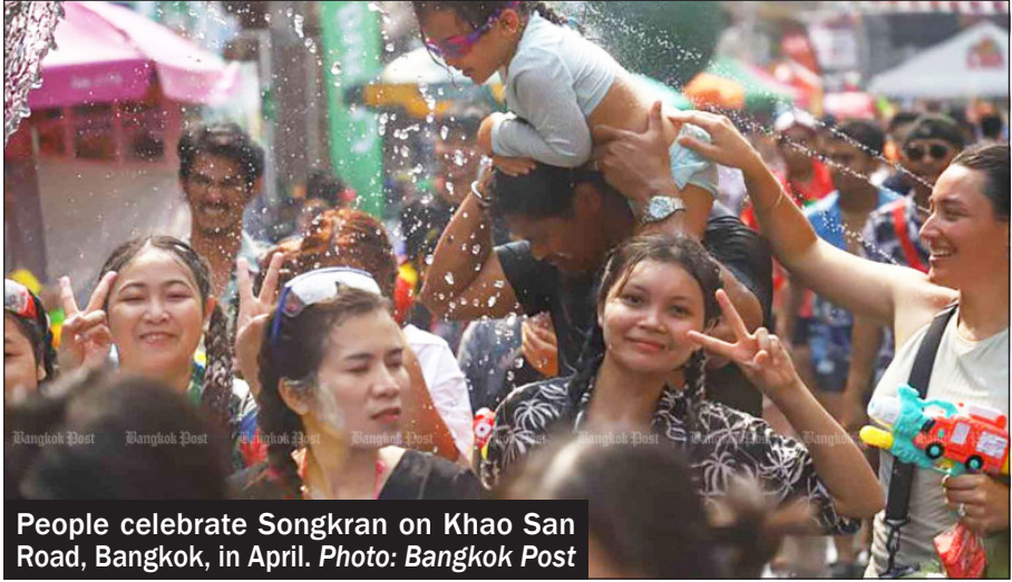
People celebrate Songkran on Khao San Road, Bangkok, in April.

But the Songkran festival will now be listed as an Intangible Cultural Heritage item by Unesco, he said, quoting the Ministry of Culture, with the official announcement due to be made at a Unesco's Intergovernmental Committee meeting