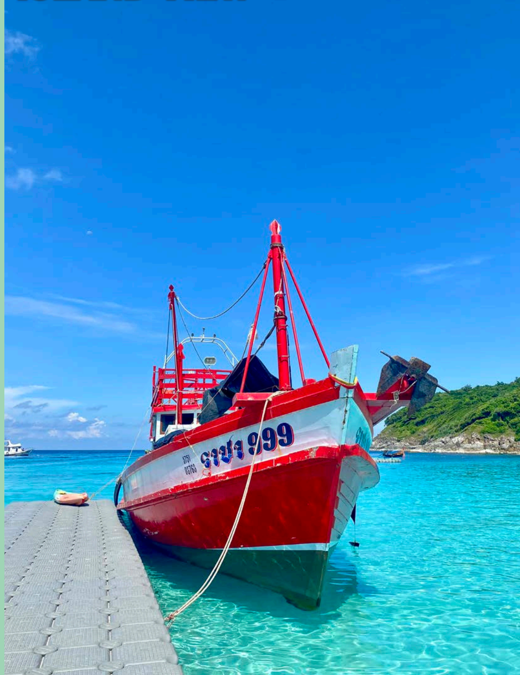
Tied up at Racha.

Got an unusual or particularly beautiful picture of Phuket? Email it to execeditor@classactmedia.co.th