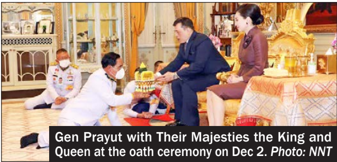
Gen Prayut with Their Majesties the King and Queen at the oath ceremony on Dec 2.

"If we make every single day of April a Songkran festival day, its value will diminish and people will be bored," he posted.