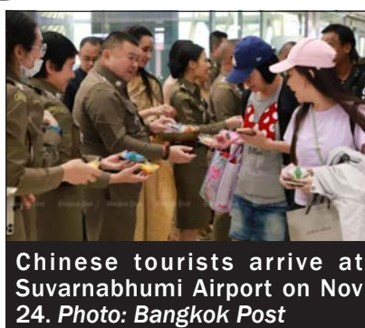
Chinese tourists arrive at Suvarnabhumi Airport on Nov 24.

The 10 airlines were named as: Air China, China Eastern, Shanghai Airlines, Spring Airlines, China Southern, Shenzhen Airlines, Juneyao Airlines, Okay Airways, Hainan Airlines and