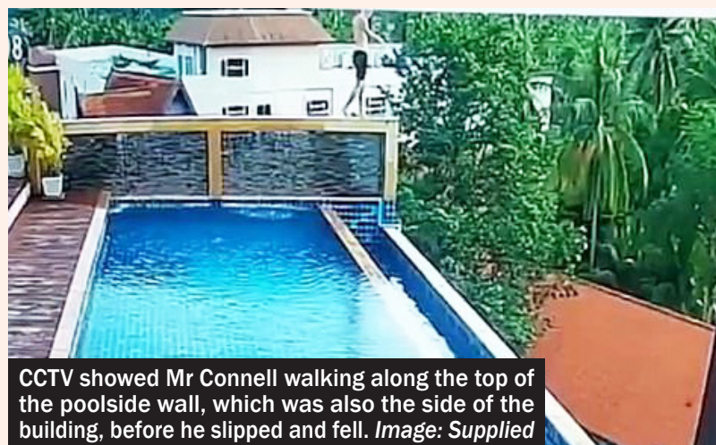
CCTV showed Mr Connell walking along the top of the poolside wall, which was also the side of the building, before he slipped and fell.