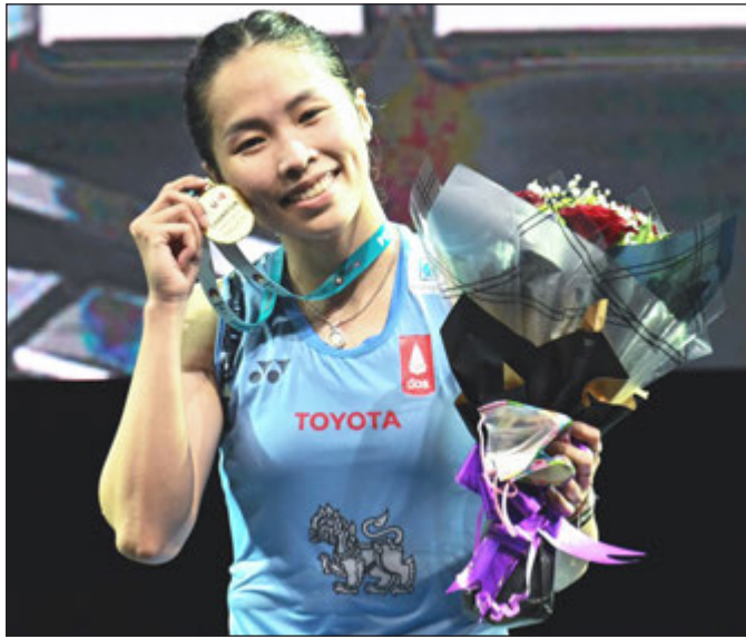
Ratchanok Intanon poses with her gold medal after her victory against China's Chen Yufei in the women's singles final on Sunday (July 3).

"I would like to congratulate May [Ratchanok's nickname] for winning the Malaysia Open title. This time she beat reigning Olympic champion Chen Yufei, the