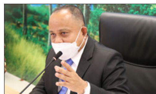
Phuket Governor Narong Woonciew delivering his message on June 28.

"This is to ensure that all sectors are ready to present themselves as hosts of the