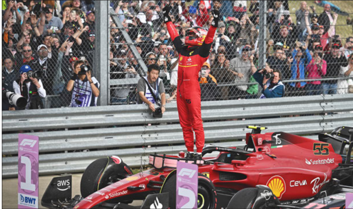
Ferrari's Carlos Sainz celebrates his victory at the British Grand Prix.

rear-ended Alex Albon as the Thai driver slowed for the accident, sending his Williams into the concrete pit wall and spinning across the track, where he collected Yuki Tsunoda and Esteban Ocon.