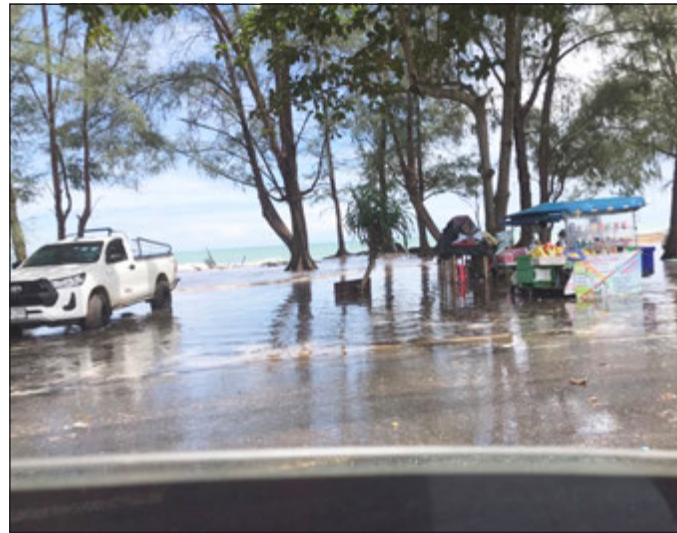
Storm waves surged onto the road heading off-island at Sai Kaew Beach, in Mai Khao.

After passing through the Phuket Checkpoint, ve-