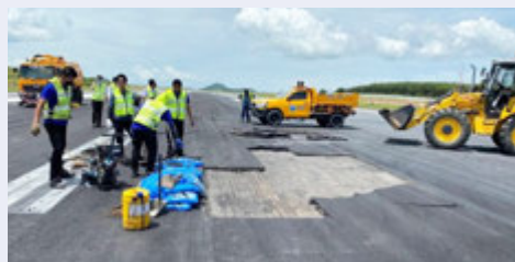
The repairs resulted in suspended flights, and long waits for passengers.

Phuket Governor Narong Woonciew arrived at the airport in the evening to be