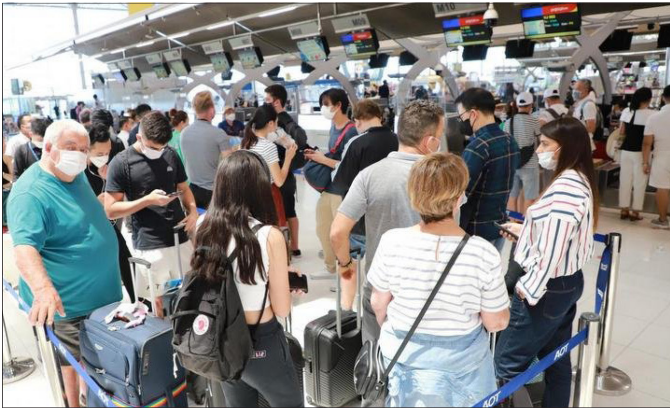
Foreign visitors queue to check in for their flights at Suvarnabhumi airport.

Air Canada plans to commence its first direct route from Vancouver to Bangkok with four flights a week using Boeing 787 jets from Dec 1, 2022 until Apr 17, 2023. Korean Air made a commitment to the TAT during its recent visit to Seoul that it would