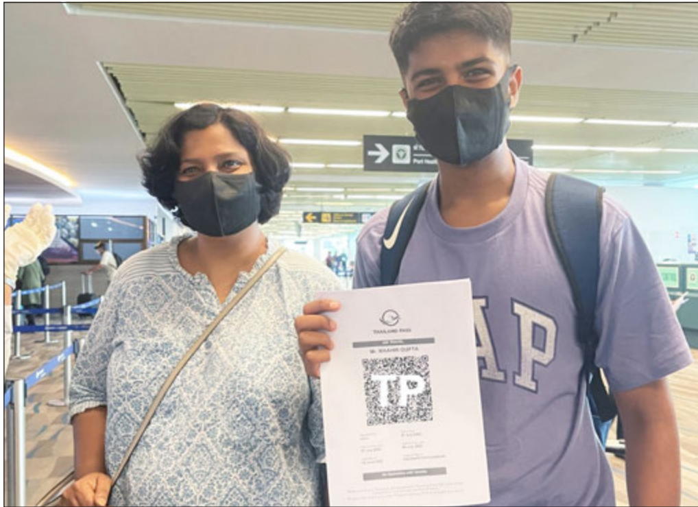
Officials were happy to mark the last tourist to arrive under the Thailand Pass scheme (pictured), but not show the public how the first tourists without a Thailand Pass were welcomed.

The new entry measures for foreigners entering the country came into effect last Saturday. Tourists are no longer required to register through the Thailand Pass system and no longer required to have US$10,000 COVID insurance.