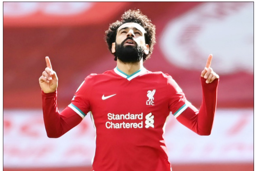
Mohamed Salah has committed his future to Liverpool.

"I feel great and excited to win trophies with the club. It's a happy day