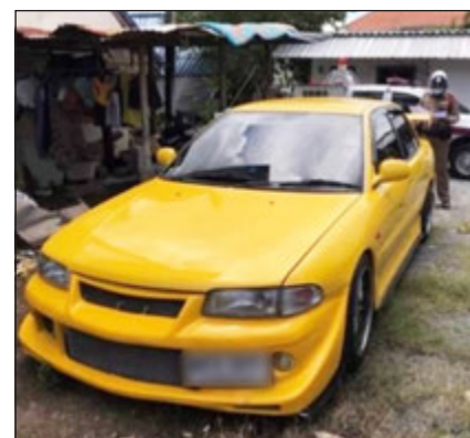
Police tracked down the man after a video clip posted online showed him driving down the wrong side of Thepkrasattri Rd.