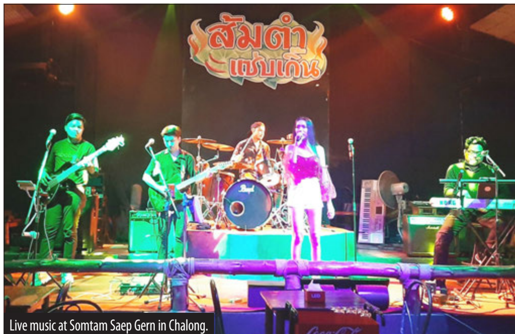
Live music at Somtam Saep Gern in Chalong.