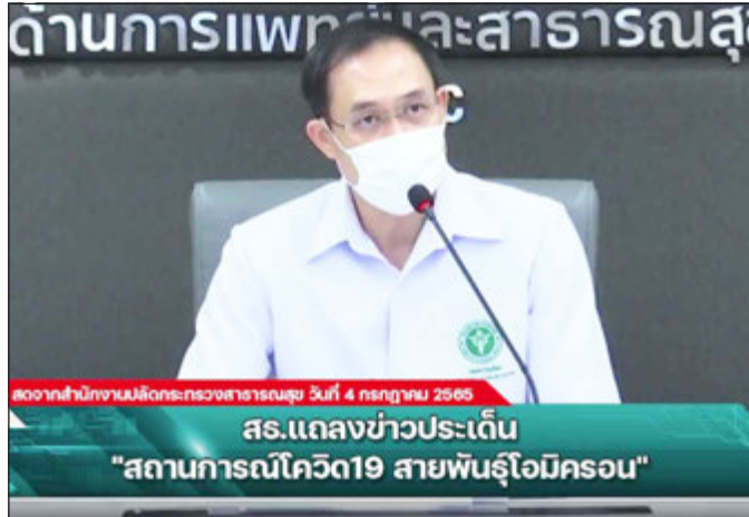
Dr Chakarat Pitayawonganon gives a COVID-19 situation overview on Monday (July 4).

The latest relaxation of most COVID-19 restrictions, starting last Friday (July 1), has been seen as the key factor in the growing number