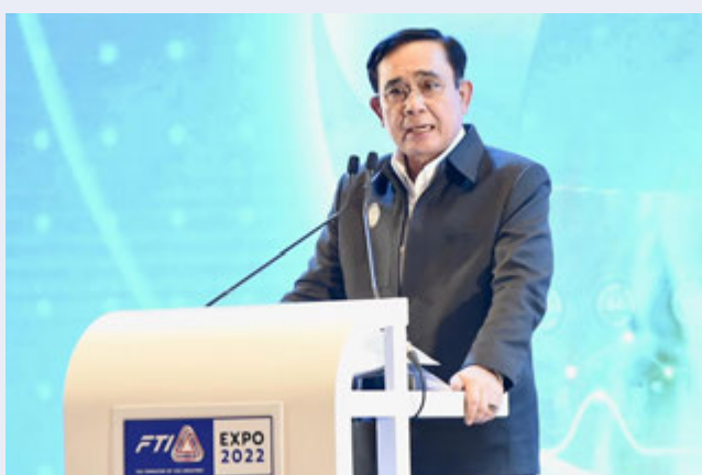
Prayut: Spring in his step.

For example, the Sadao border pass in Songkhla has