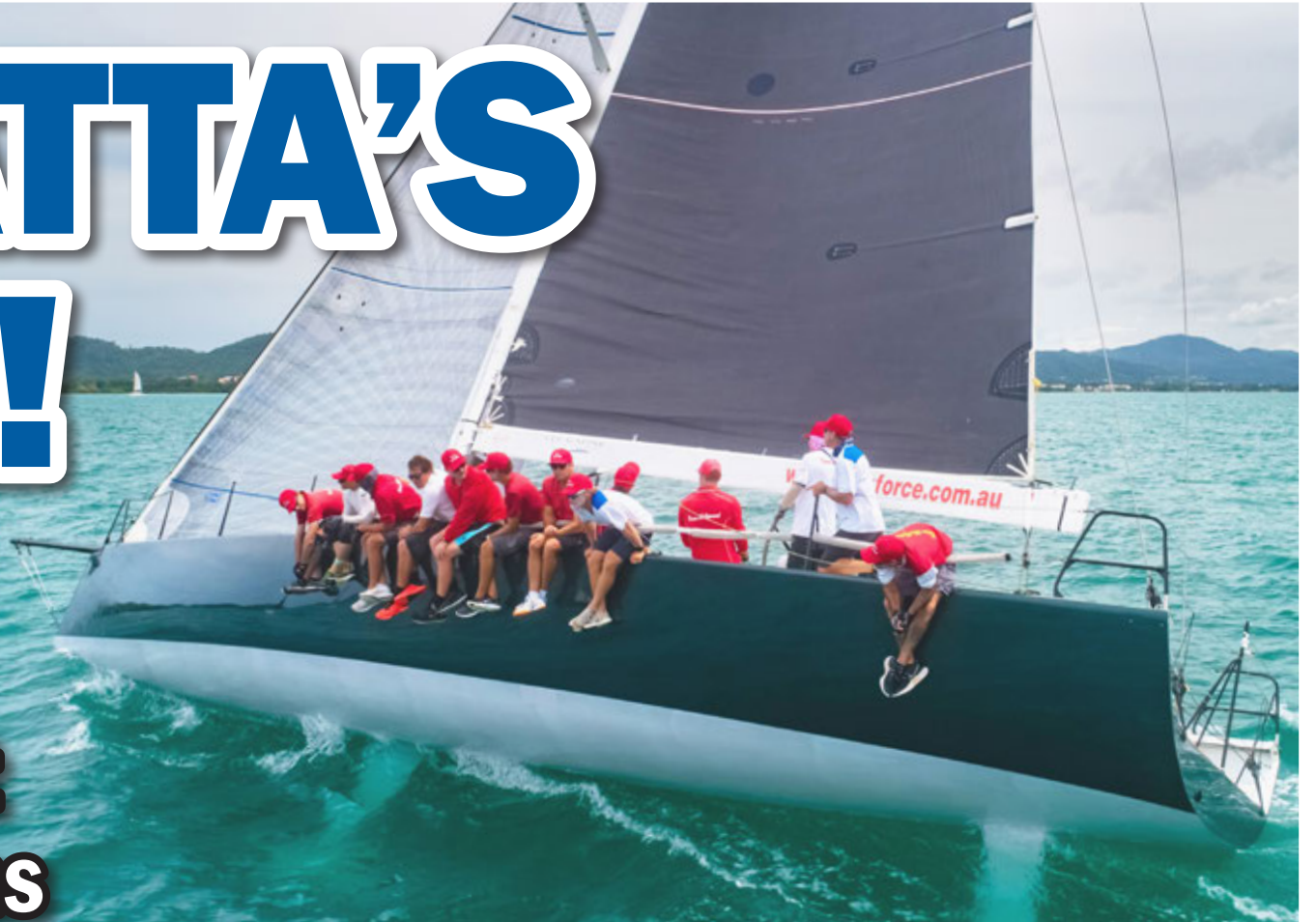
Sailing action returned with Phuket Raceweek last weekend.

Heavy weather fails to dampen spirits as Phuket Raceweek returns