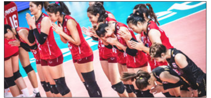
The Thai team after their loss to Italy on Sunday (July 3).