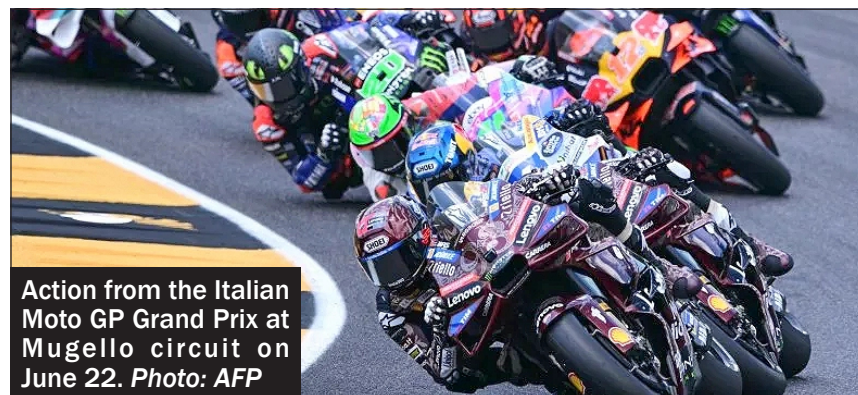
Action from the Italian MotoGP Grand Prix at Mugello circuit on June 22.

On June 23 the Commission said it was satisfied that, in the European national markets it investigated, "the companies are not close competitors for the licensing of