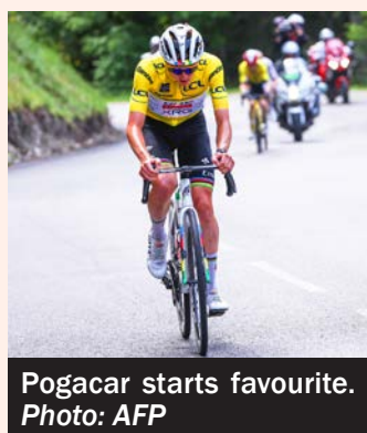
Pogacar starts favourite.

Team UAE's Pogacar starts as red-hot favourite