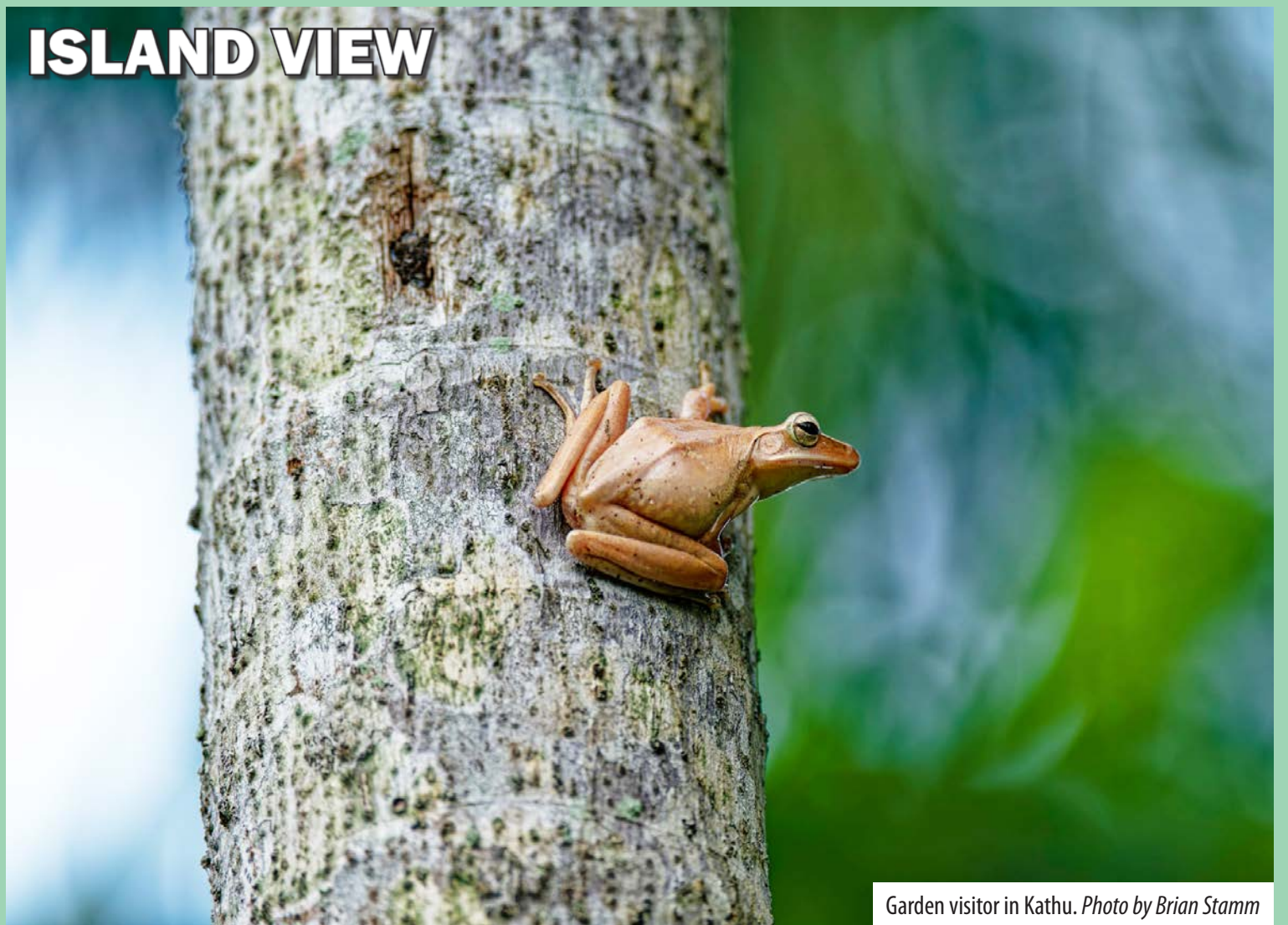
Garden visitor in Kathu.

Got an unusual or particularly beautiful picture of Phuket? Email it to editor3@classactmedia.co.th