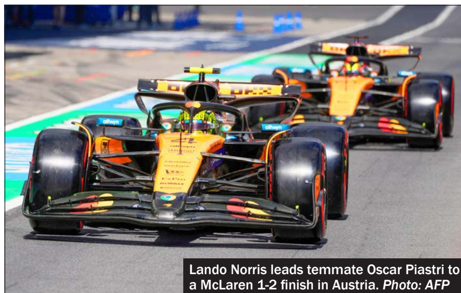
Lando Norris leads teammate Oscar Piastri to a McLaren 1-2 finish in Austria.

"I hope it was good watching because from inside the car it was