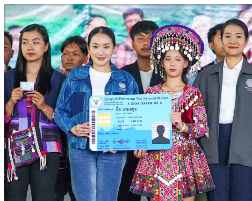
PM Shinawatra at an event to grant Thai national ID cards in Chiang Rai on June 28.

Interior Ministry permanent secretary Unsit Sampantararat said the government of Prime Minister Paetongtarn Shinawatra had instructed the Interior Ministry to implement the regulation in line with the Cabinet's resolution approved during the