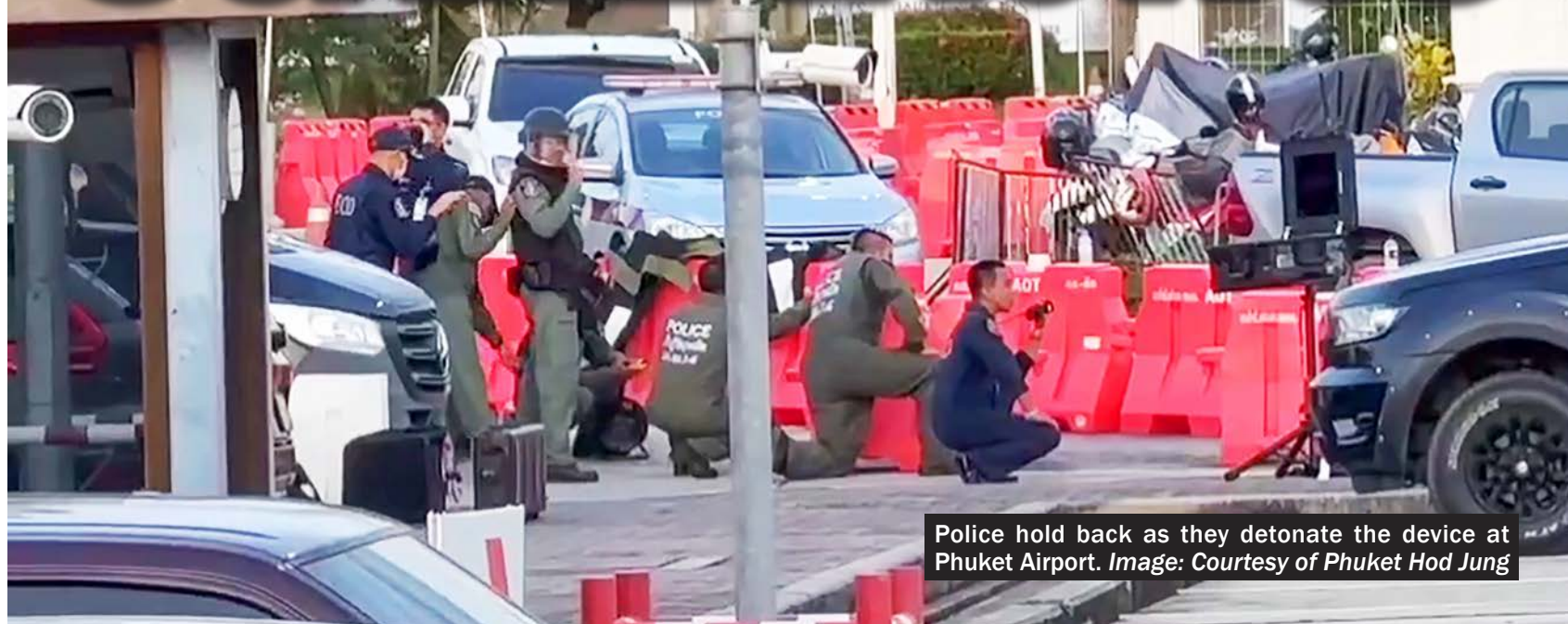
Police hold back as they detonate the device at Phuket Airport.