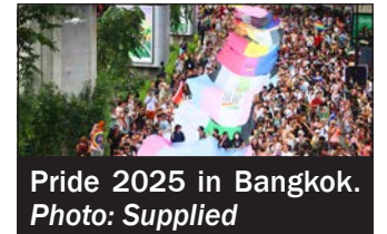
Pride 2025 in Bangkok.

Public Health Ministry deputy spokesman Jirapong Songwatcharaporn said the move responded to growing concerns over the health risks of unsupervised hormone use among transgender people, which had led to serious side effects and even