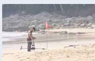
A security official scans Surin beach in Phuket last week.