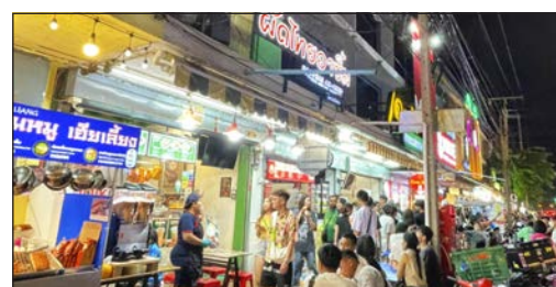
Street food stalls line Banthat Thong Road. The central bank says the nation has an oversupply of eateries. Photo:

The regulator projects 4.4mn Chinese tourists this year, down from a previous forecast of 5.1mn, while next year the projection is 6mn, down from 7.1mn.