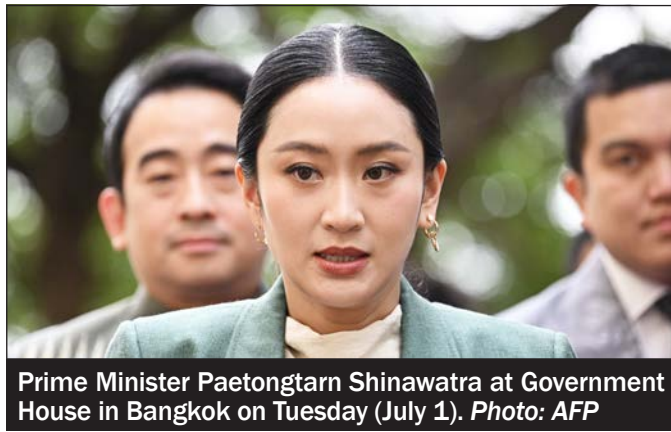
Prime Minister Paetongtarn Shinawatra at Government House in Bangkok on Tuesday (July 1).

The court was set to decide whether to accept a petition initiated by 36 senators accusing her of serious ethical violations shown in a leaked audio of