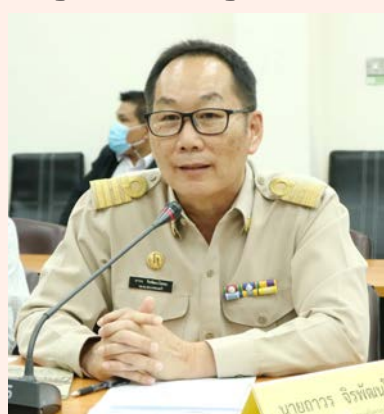
Thaworn Chirapattanasophon, the Phuket Town Deputy Mayor sentenced to jail for corruption.

The Criminal Court for Corruption and Misconduct Region 8 found Thaworn and his group guilty of unlawfully approving a project extension