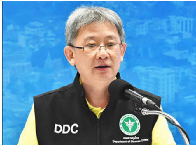
Dr Opas Karnkawinpong, director-general of the Department of Disease Control.

tion shows that monkeypox infection does not spread as easily as COVID-19. Transmission requires close interaction with a symptomatic individual," Dr Opas said.