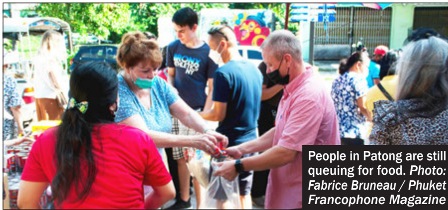
People in Patong are still queuing for food.

"More funds mean better food quality, and this will enable us to go back to the normal rhythm, which was from 200 to