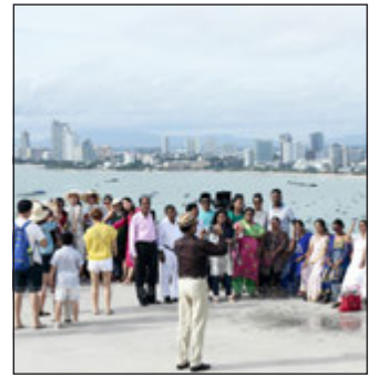
Indian tourists in Pattaya in 2018.

Apart from India, TAT is also focusing on the Middle East region as well as Thailand's neighbouring countries