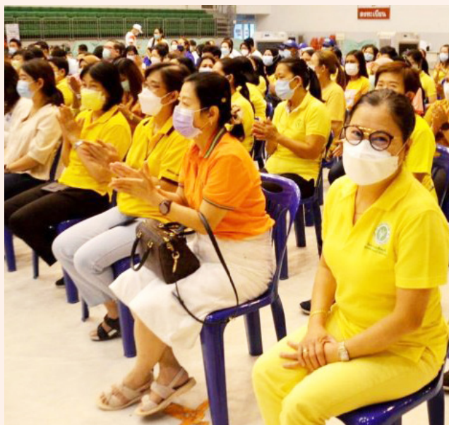
The vaccination centre at Sapan Hin is now officially closed.