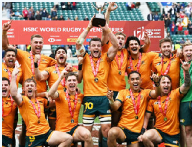
Australia celebrate their win at Twickenham.

Reigning overall champions South Africa could have retained their title on Sunday, but instead the Blitzboks were beaten in the last eight by Australia after blowing a 17-point lead.