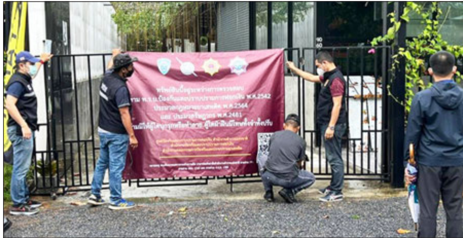
Officers seize the Naiyang Bay Cafe.

The investigation was launched after two men, Rukman Wa-nga and Je Muharushi, were arrested with one kilogramme of crystal meth (ya ice) and 1,399,200 methamphetamine pills (ya