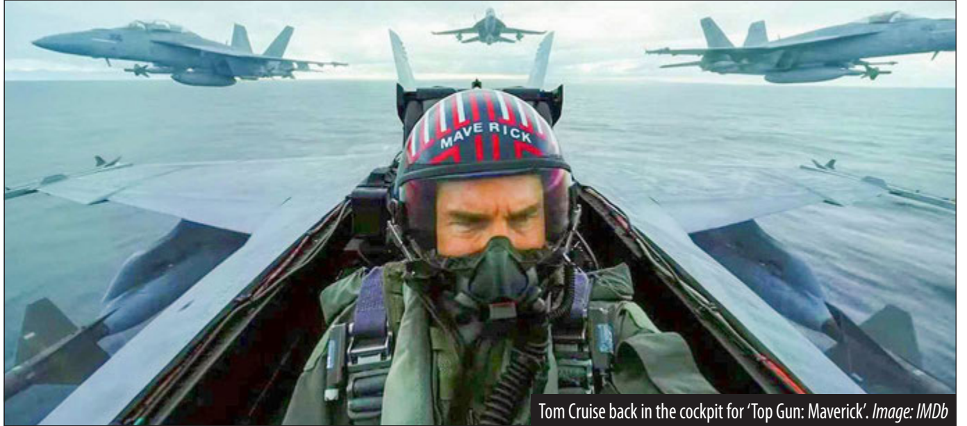
Tom Cruise back in the cockpit for 'Top Gun: Maverick'.

To the credit of Kosinski and Tom Cruise, who had a lot of creative input into the film, what we have is a sequel that more than matches the original film.