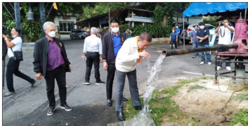
Sakda Vicheansil, Director-General of the Department of Groundwater Resources, samples the water pumped from one of the wells bored to assess Phuket's groundwater reserves.

"There is also the agricultural sector, which covers most of the island, and continuous expansion of urban communities in the Phuket area has