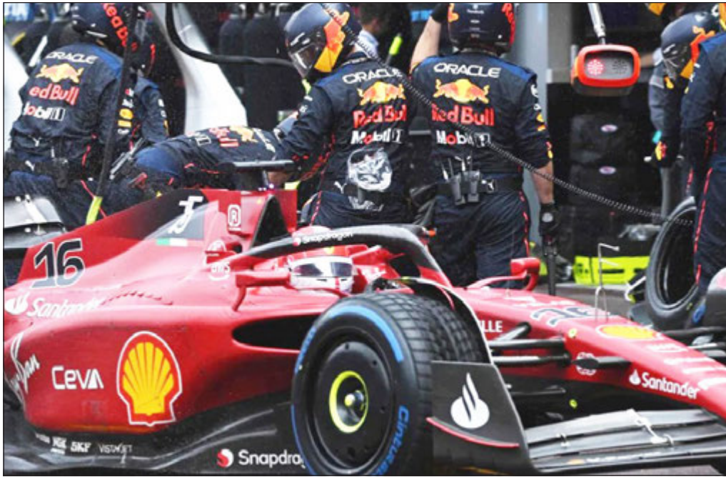
Ferrari's Charles Leclerc in the pit lane at the Monaco Grand Prix last Sunday (May 29), where he experienced multiple problems.

So when Leclerc started in pole on the grid ahead of the race, he had every confidence he'd be soaking up victory by the end of the afternoon.