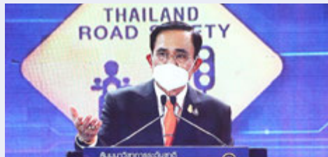
Prime Minister Prayut at the Bangkok seminar.

Most accidents in Thailand involve motorcycles with riders often neglecting to wear helmets or driving while under