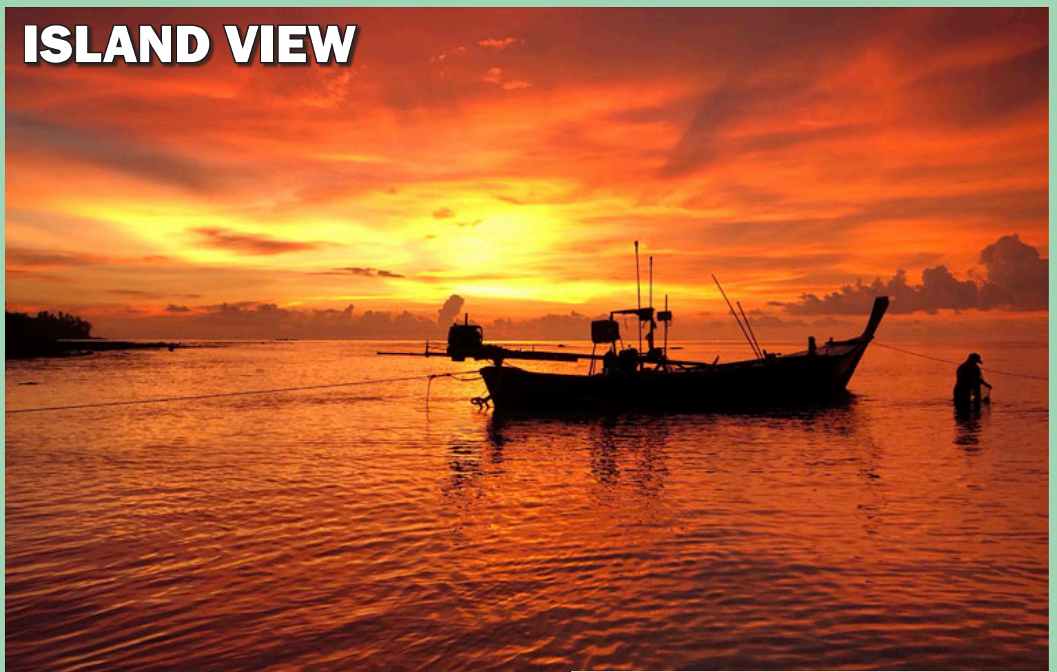
Longtail afore a blazing sunset at Kamala Beach.

Got an unusual or particularly beautiful picture of Phuket? Email it to exeditor@classactmedia.co.th