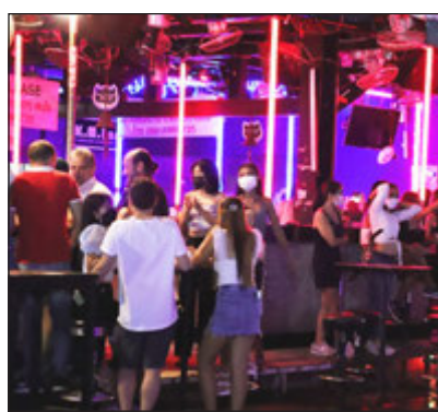
Cinderella Street: Punters at bars on Bangla Rd have until midnight to enjoy themselves.