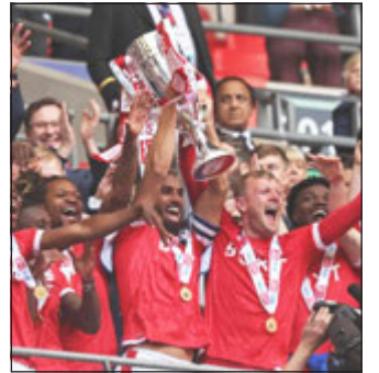
Forest's players celebrate.

sonal triumph for Cooper, who has revitalised Forest since replacing the sacked Chris Hughton in September when the team were bottom of the table after taking one point from their first seven games, their worst start to a season for 108 years