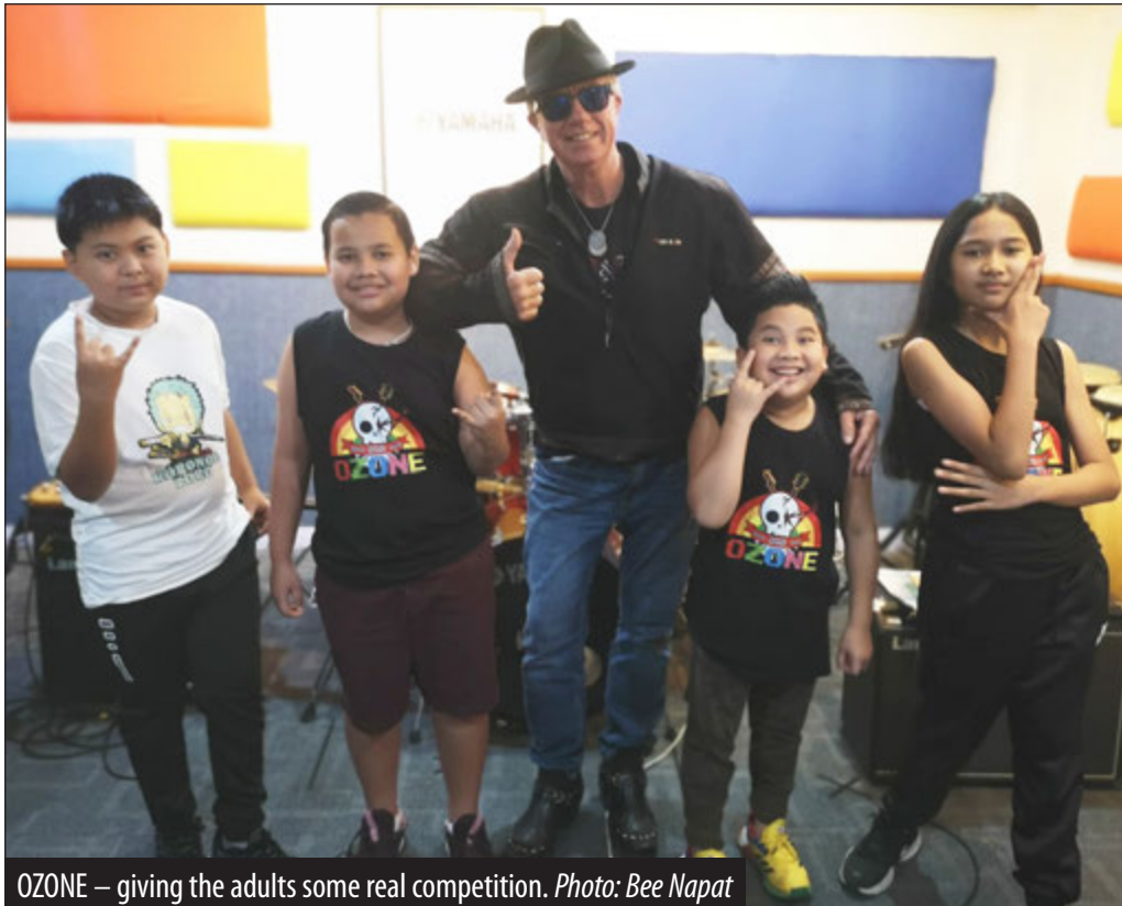
OZONE – giving the adults some real competition.